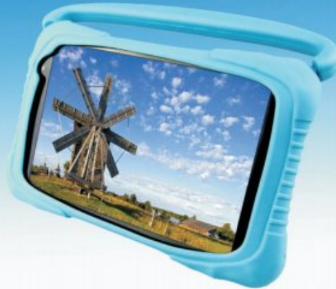
S7-8-63XJ78 (With Cover)