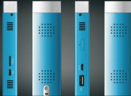
X1 S Compute Stick