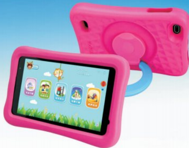
S8 (With Cover)