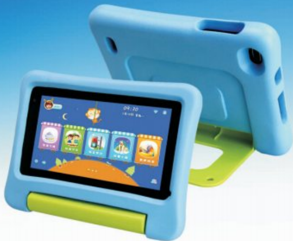
S7 (With Cover)